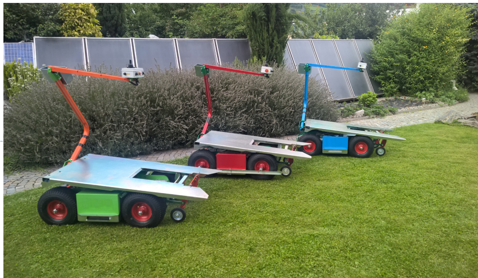
ALI3 used on harvesting platforms