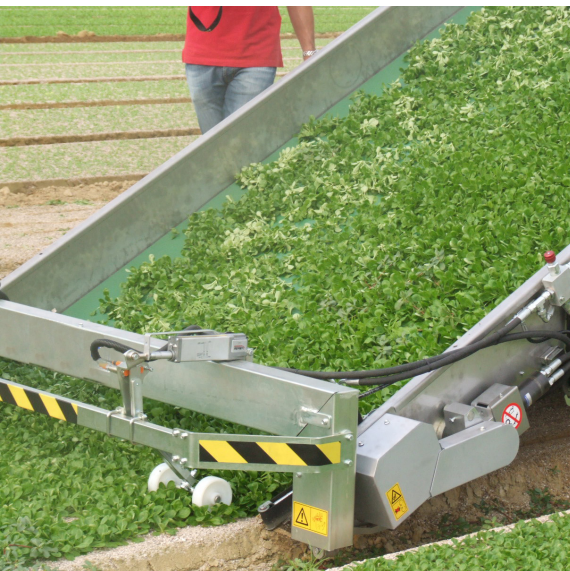
ALI1 used on a salad picker machine